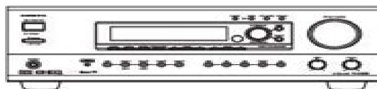
Black, Golden and Silver models