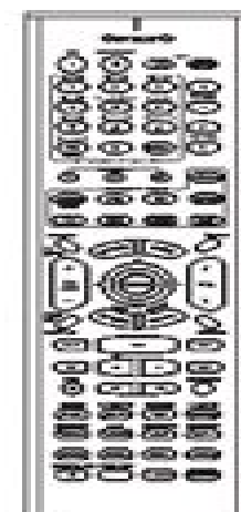
RC-S60M or RC-S61M