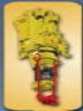
Power & control pipelines