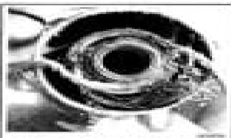
Fig. 8 Excellent view of rope and fishing line entangled behind the propeller. Exposed flapping line was actually cut through the seal, allowing water to enter the lower unit and lubricant to escape