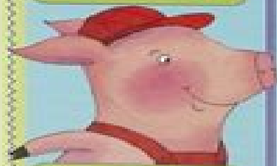
PIG IN RED