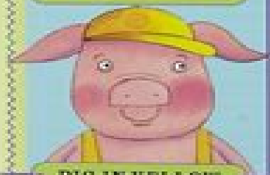
PIG IN YELLOW