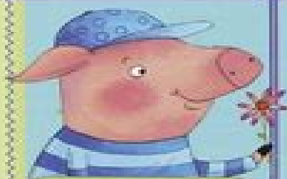
PIG IN BLUE