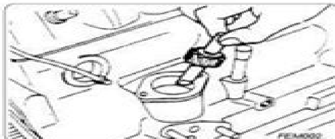
Removal of Distributor and Distributor Driving Spindle