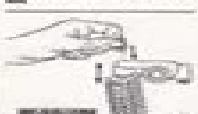
Fig. 9 The timing belt drive system. The timing belt is located at the front of the engine, behind the timing cover. The timing belt is responsible for the timing of the engine's valves and pistons.