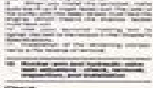
Fig. 8 The timing belt drive system. The timing belt is located at the front of the engine, behind the timing cover. The timing belt is responsible for the timing of the engine's valves and pistons.