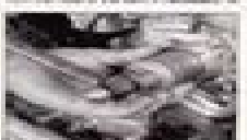
Fig. 6 The timing belt drive system. The timing belt is located at the front of the engine, behind the timing cover. The timing belt is responsible for the timing of the engine's valves and pistons.