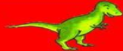
تيرانوسورس ريكس Tyrannosaurus Rex