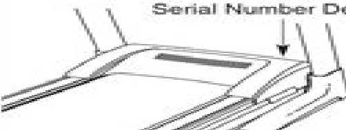
Serial Number Decal

Find the serial number in the location shown below. Write the serial number in the space above for reference.