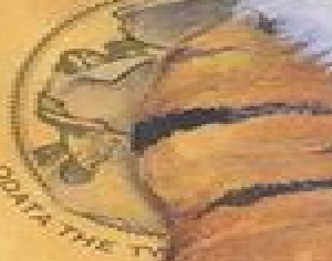
ODDPA THE T