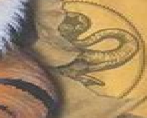
ODDPA THE T