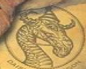
DRASTY THE DRAGON