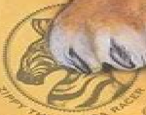
ZIPPY THE ZEBRA RACER