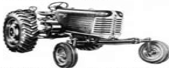
ROW CROP ADJUSTABLE FRONT AXLE