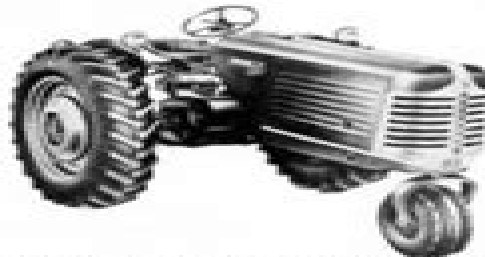
ROW CROP SINGLE FRONT WHEEL