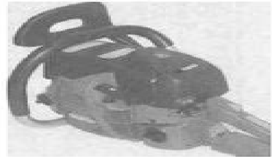
56CC, 62CC Chainsaw