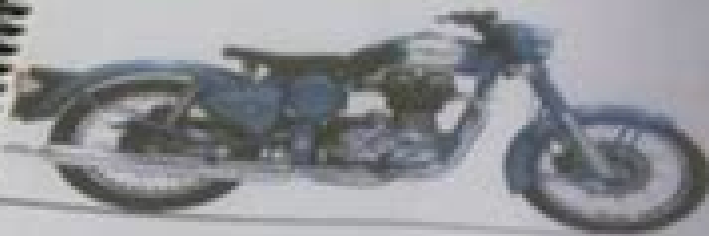
Bullet Classic EFI (G5)