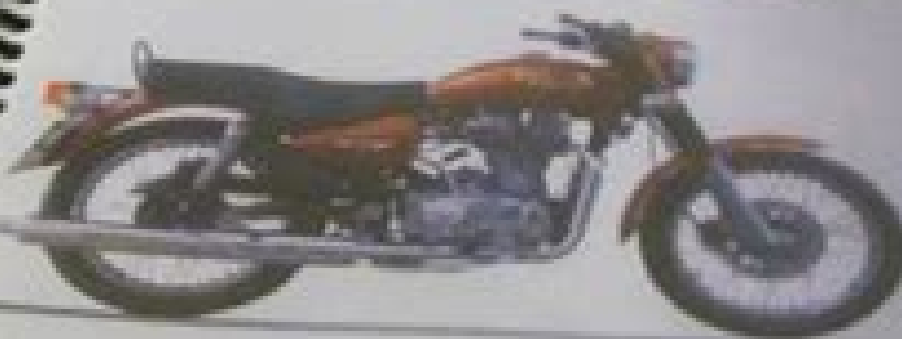
Bullet Classic EFI (G5)