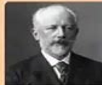
Piotr Ilich Chalkovski 1840–1893