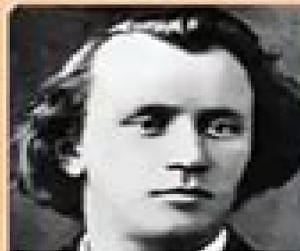
Johannes Brahms 1833–1897