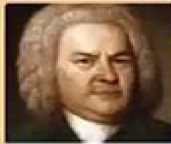
Johann Sebastian ... 1685–1750