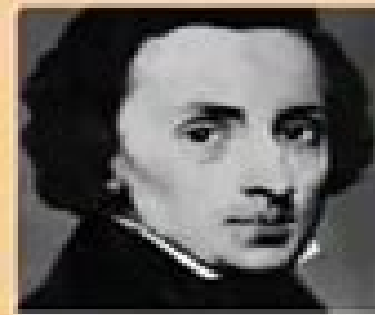
Frédéric Chopin 1810–1849