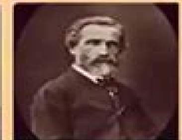
Giuseppe Verdi 1813–1901