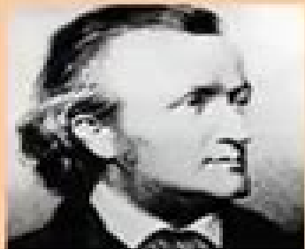
Richard Wagner 1813–1883