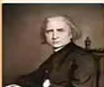
Franz Liszt 1811–1886