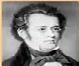
Franz Schubert 1797–1828