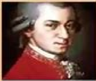
Wolfgang Amadeus M... 1756–1791