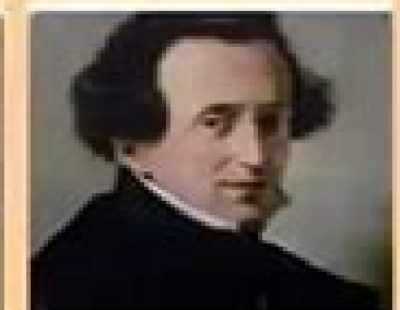
Felix Mendelssohn 1809–1847