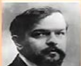
Claude Debussy 1862–1918