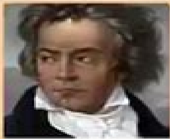
Ludwig van Beethoven 1770–1827