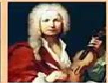
Antonio Vivaldi 1678–1741