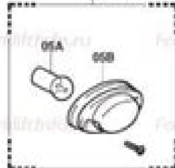
05(LPG, STEEL CABIN)