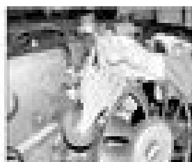
4.6i ... and remove the tensioner