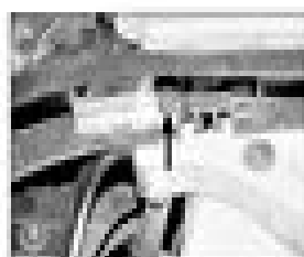
4.6d ... and the cam shaft with the wing nut