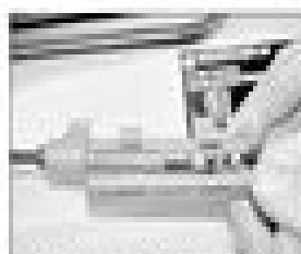
4.6g Separate the front section of the lower timing cover