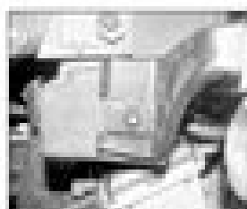
4.6f ... and the air diverter with headring

8 If the timing belt is to be refitted, mark it