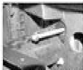
4.6a Tighten the bolt to support the belt cover