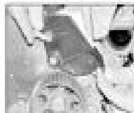
4.67 Remove the rear timing belt cover (engine codes A6P, A6B, A6J and A6K)