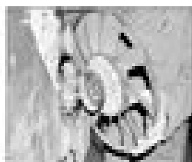
4.6k ... and remove the tension bar and