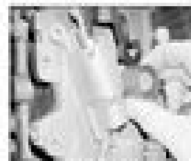
4.68 Remove the timing belt tensioner roller (engine codes A6P, A6B, A6J and A6K)