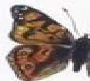
Dama Patagónica Patagonian Lady Vanessa antipodica 6 cm