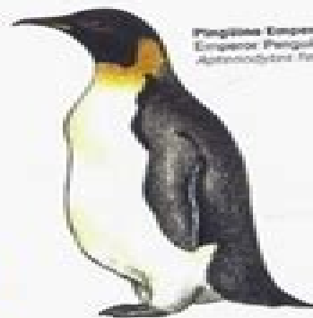
Pingüino Emperador Emperor Penguin Aptenodytes forsteri / 90 cm