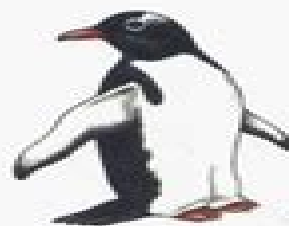
Pingüino Pico Rojo Chinstrap Penguin Pygoscelis adeliae / 40 cm