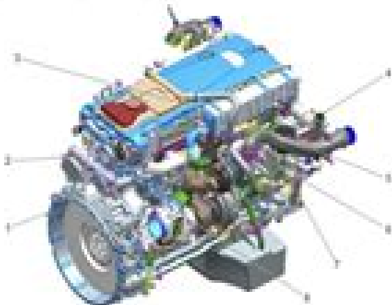
Fig 1.1. D04 Right Side View