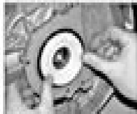
15.12 Fitting the seal housing with plastic shims in position

draw out the oil seal footings to its final position.