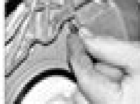
15.13a Fit the flywheel back into position