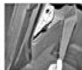
6.2 Pull back the carpet panel