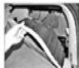
6.2e Remove the rear wing compartment