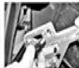
6.2d Push back in and test to remove