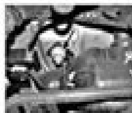
4.3 Fuel tank retaining bolt - note shape

by disconnecting from the differential flange, refer to Chapter 8 for further information.