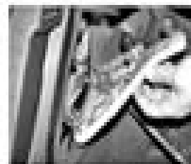
6.2c ... and remove the subframe