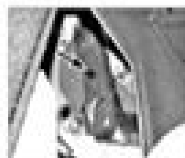
6.2b Remove the retaining clip

12 Remove the retaining clip, and then withdraw the subframe from the rear of the light unit. See Illustrations.