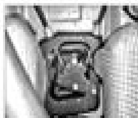
4.2 Disconnect the tank-to-tank cables