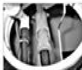
4.1a Lower connections at tender unit