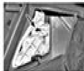
6.2b ... release the locking cable