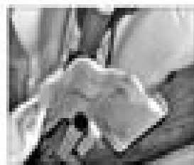
4.1 Remove tank stands

1 The fuel tank must be checked before the operation can be started. This is done