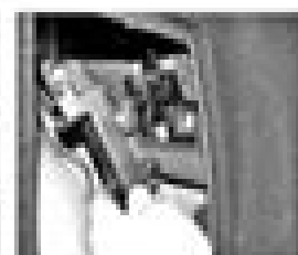
6.2c ... and withdraw the subframe