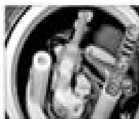
4.1b ... and upper connections

High pressure rapidly withdraws the tender unit from the fuel line. Remove the wiring points.