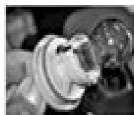
6.1a Remove the body from the tender

3 Test the cooling system as described in Chapter 10.