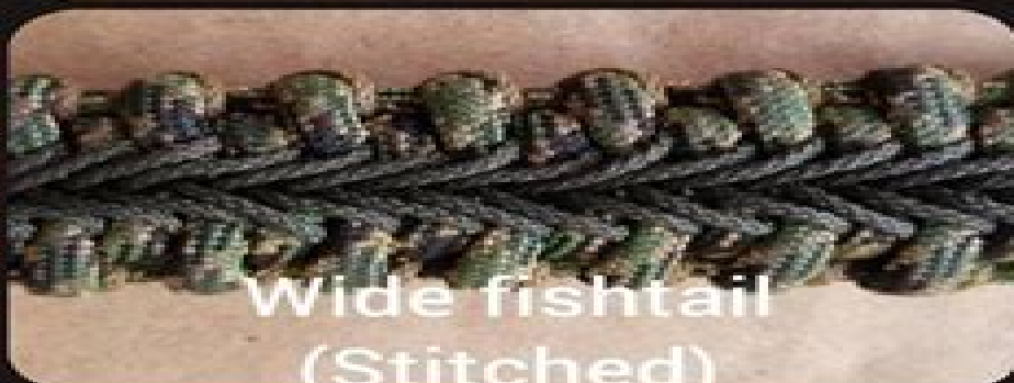
Wide fishtail (Stitched)