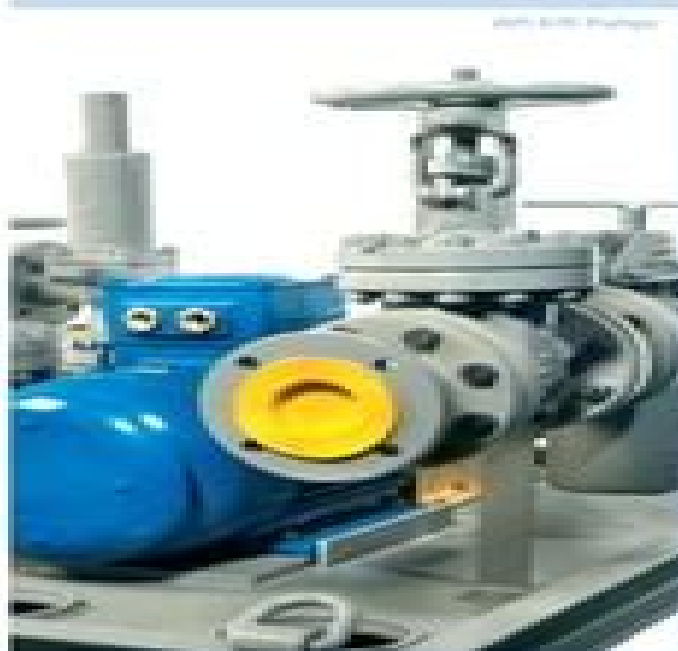
Large Double Helical Pump