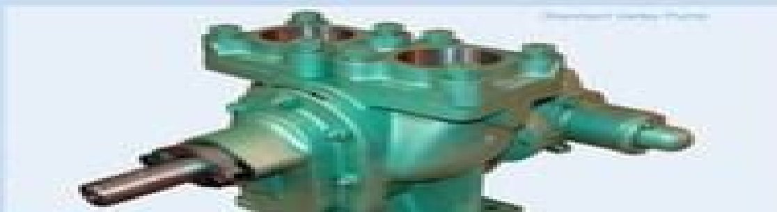
Green Double Helical Pump