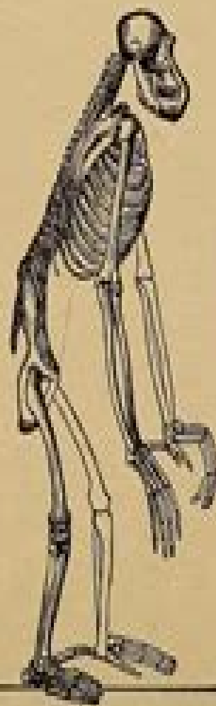
FIG. 206. (Plate XIV. Fig. 1.) Chimpanzee.