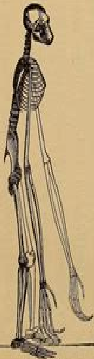
FIG. 204. (Cf. p. 181.) Gibbon.