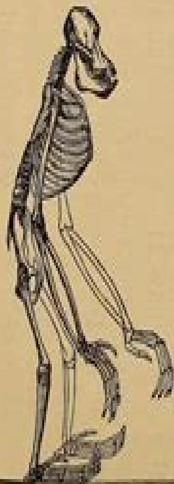
FIG. 205. (Plate XIV. Fig. 3.) Orang-outang.