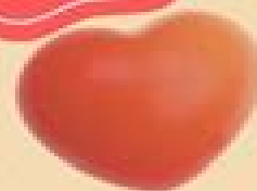
Heart 心 (xīn)