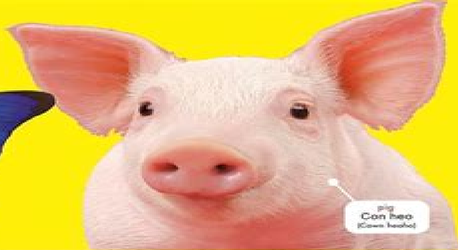
pig Con heo (Côn heo)