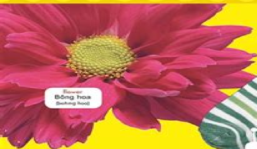
flower Bông hoa (Bông hoa)