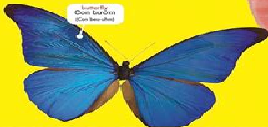
butterfly Con bướm (Côn bướm)