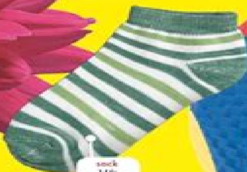
sock Vớ (Vớ)