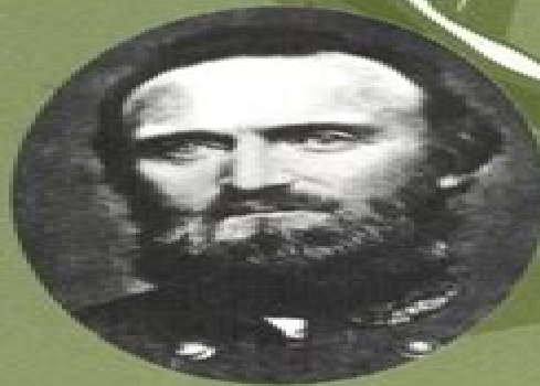
General Thomas J. "Stonewall Jackson" C.S.A.