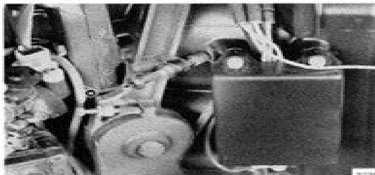
a - Maximum Spark Advance Screw