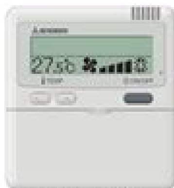
«WIRED REMOTE CONTROL» RC-E3