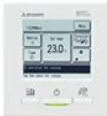
«WIRED TOUCH REMOTE CONTROL» RC-E3X series