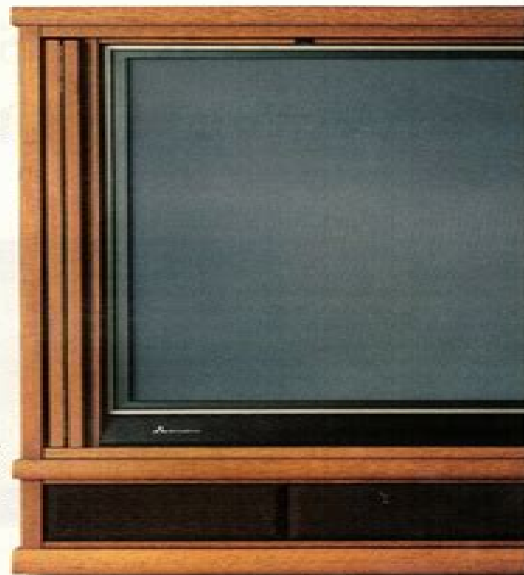
Our new 60-inch big screen television includes our Diamond Vision II™ wireless remote that includes VCR controls (for select Mitsubishi VCRs).

In addition, our new Dynamic Beam forming actively refocuses the beam at every position on the screen, enabling us to minimize distortion. So our Diamond Vision II™ offers 15% sharper focus at the center of the picture and 40% improvement at the edges.