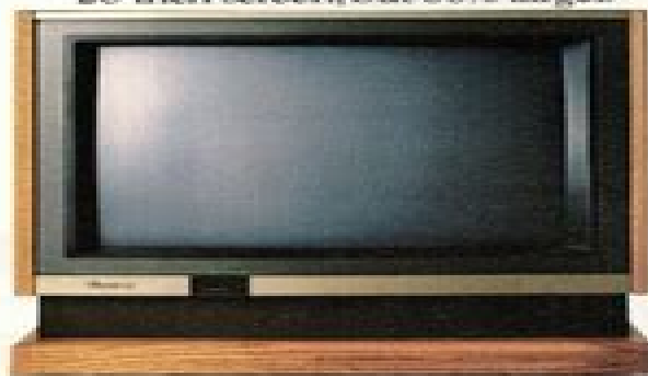
The world's first 35-inch, direct-view television. It's 86% larger than a 26-inch set, and can deliver a stunning 760 lines of resolution.

Which helps explain how in 1986, we were the only television manufacturer with the technology to create a 35-inch conventional tube television. With a picture as sharp and clear as a 26-inch screen, but 86% larger.