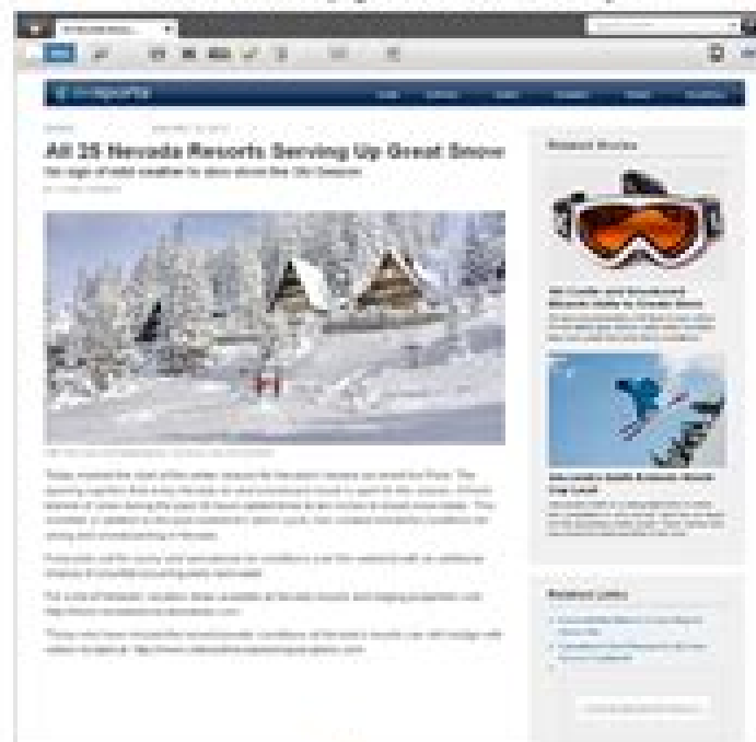
Web Mode: Web page view of a content entry form

Content entered into the content entry form (in Form Mode or Web Mode) is stored as a record in the CM system database.