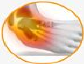
Sprains and Strains