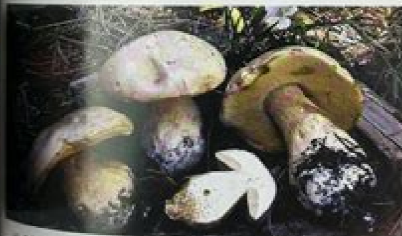
141. Boletus leucon (White King Bolete), p. 529