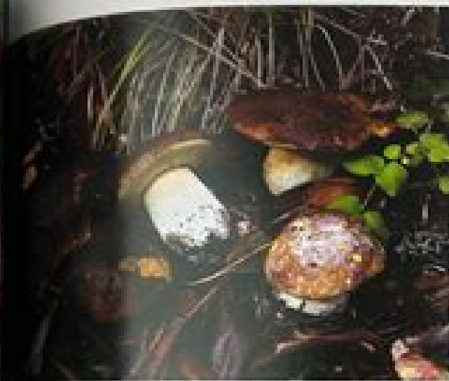
140. Boletus annuus (Queen Bolete), p. 530. Cap is dark brown with a white bloom when young; cinnamon-brown or paler later.