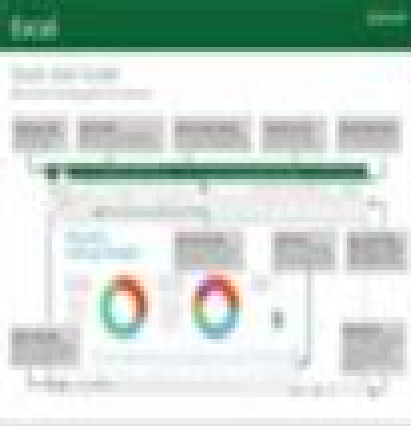
Excel View Excel PDF