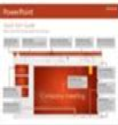
PowerPoint View PowerPoint PDF