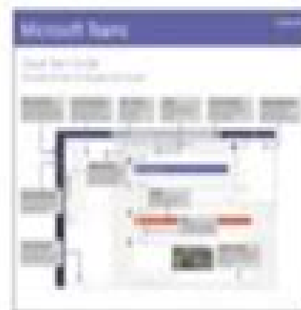
Teams View Teams PDF