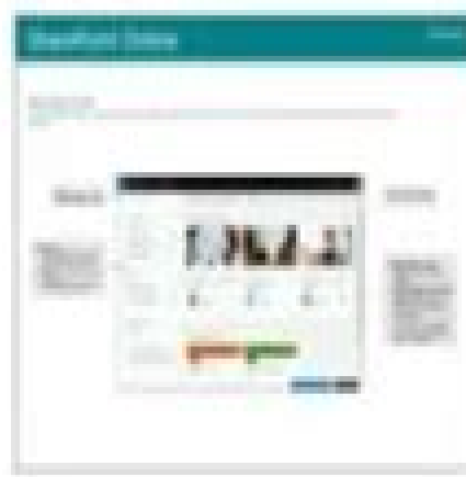
SharePoint Online View SharePoint Online PDF