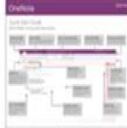
OneNote View OneNote PDF