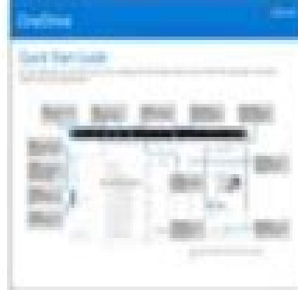
OneDrive View OneDrive PDF