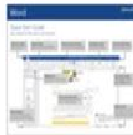
Word View Word PDF