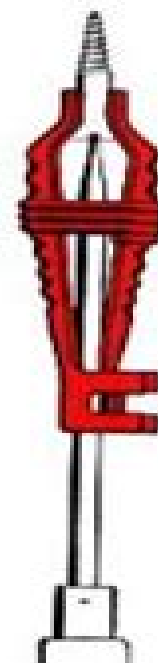
fig. 133 Spaninrichting voor vertoeken kappen.

De inwendige constructie van de slagschroevendraaier is zodanig, dat hij zowel linksom als rechtsom kan draaien (fig. 135) en dus bouten los maar ook vast kan draaien.