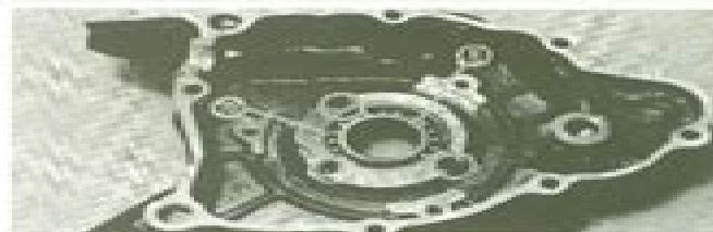
1. Bearing 2. Bearing retainer