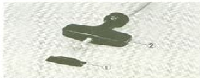
1. Handle cap 2. Starter handle

bearing securing bolts, and install the bolts and a bearing retainer onto the spacer. Torque the bolts to specification.