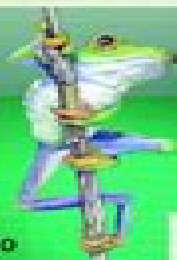
ranita de San Antonio