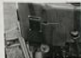
Fig. 1 - Tractor Serial Number

The Tractor Serial Number is recorded on a plate attached to the instrument panel.