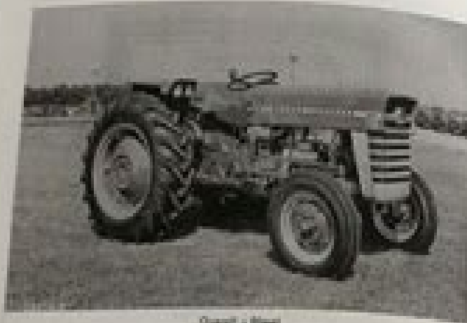
Overall - 1000