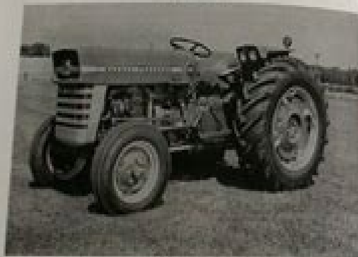
Overall - 500