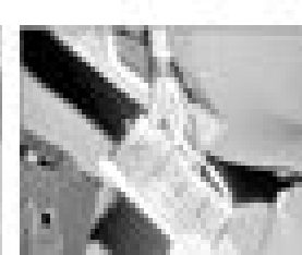
47.19 ... and withdraw the screen from the surround