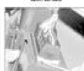
47.16 Release the clip ...