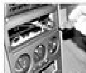
47.9 Removing the heater controls from the rear of the dashboard panel

draw them to the control panel. If necessary, undo the screws and remove the multi-function display unit from the panel See Illustration 6 .