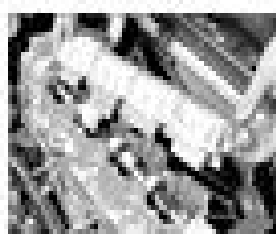
4.3 Removing the crankshaft pulley from the engine

3. Remove the crankshaft pulley retaining bolt. To prevent crankshaft rotation on manual transmission models, have an assistant secure