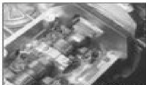
10.11b. The BMW camshaft-holding tool in position on the M40 engine.

10 If it's necessary to remove the camshaft or the intermediate-shaft sprocket, remove the sprocket bolt while holding the sprocket to prevent it from moving. To hold the sprocket, wrap it with a piece of an old timing belt (dotted line engaging the sprocket tooth) or