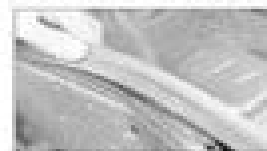
2-5a. Radiator assembly (from top view of the radiator)

2-5a. Radiator assembly (from top view of the radiator) 2-5b. Radiator assembly (from side view of the radiator) 2-5c. Radiator assembly (from front view of the radiator) 2-5d. Radiator assembly (from rear view of the radiator) 2-5e. Radiator assembly (from bottom view of the radiator) 2-5f. Radiator assembly (from top view of the radiator) 2-5g. Radiator assembly (from side view of the radiator) 2-5h. Radiator assembly (from front view of the radiator) 2-5i. Radiator assembly (from rear view of the radiator) 2-5j. Radiator assembly (from bottom view of the radiator) 2-5k. Radiator assembly (from top view of the radiator) 2-5l. Radiator assembly (from side view of the radiator) 2-5m. Radiator assembly (from front view of the radiator) 2-5n. Radiator assembly (from rear view of the radiator) 2-5o. Radiator assembly (from bottom view of the radiator) 2-5p. Radiator assembly (from top view of the radiator) 2-5q. Radiator assembly (from side view of the radiator) 2-5r. Radiator assembly (from front view of the radiator) 2-5s. Radiator assembly (from rear view of the radiator) 2-5t. Radiator assembly (from bottom view of the radiator) 2-5u. Radiator assembly (from top view of the radiator) 2-5v. Radiator assembly (from side view of the radiator) 2-5w. Radiator assembly (from front view of the radiator) 2-5x. Radiator assembly (from rear view of the radiator) 2-5y. Radiator assembly (from bottom view of the radiator) 2-5z. Radiator assembly (from top view of the radiator)