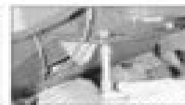
2-5e. Radiator assembly (from bottom view of the radiator)