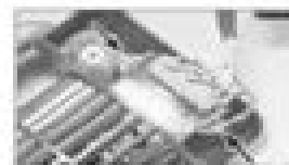
2-5d. Radiator assembly (from rear view of the radiator)