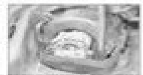
2-5c. Radiator assembly (from front view of the radiator)