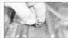
2-5b. Radiator assembly (from side view of the radiator)