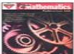
Grade 4 • NL1307