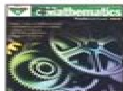
Grade 6 • NL1309