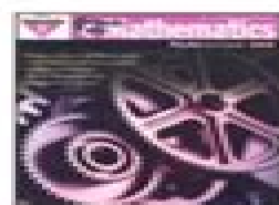
Grade 2 • NL1305