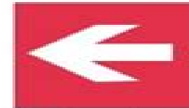
Directional Arrow *