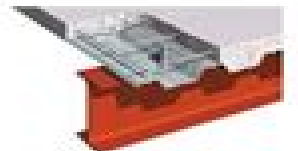
H/L Headed Concrete Anchors