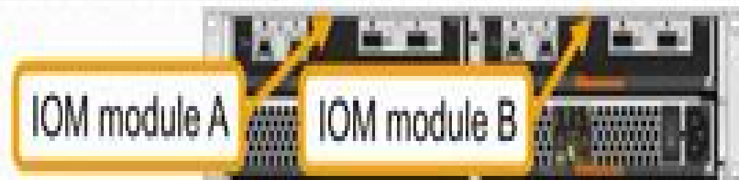
IOM module A