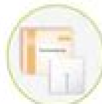
Split 4x4 gauze

"DO NOT attempt to cut yourself, filaments from gauze may enter trach"