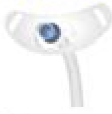
Sterile trach replacement tube