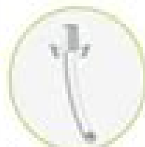
Disposable inner cannula