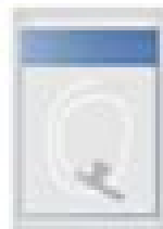
Tracheal suction equipment