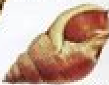
Channeled Nassa (CA)

Scaphella junonia johnstoni To 3 in. (7.5 cm) Deep water Gulf Coast shell only reaches up on shore after storms. Alabama's state shell.