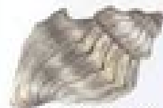
Frilled Dogwhelk (W)

Collusio sp. To 1 in. (2 cm) high Pearl-like, strongly ridged shell is as wide as it is high.