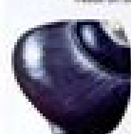
Black Top Shell (W)

Polinices limax To 1 in. (2.5 cm) high Rounded shell is grayish to brownish, (dark to red) to bore holes into biofilms.