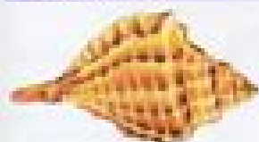
Thick-shelled Oyster Drill (E)

Euryspira caudata To 1.5 in. (4 cm) high Small shell has a pointed apex and spiral ridges. Feeds primarily on oysters.