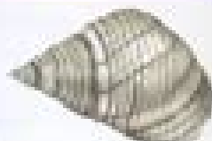
Marsh Periwinkle (CB,V)

Euryspira caudata To 1.5 in. (4 cm) high Small shell has a pointed apex and spiral ridges. Feeds primarily on oysters.