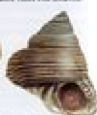
Ribbed Top Shell (W)

Hydrobia ulitiformis To 1 in. (2 cm) high Cone-shaped shell is blackish to brownish-gray. Feeds on biofilms.