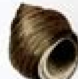
Common Periwinkle (B,V)

Euryspira angulata To 1 in. (2 cm) high Shell has 4-10 ribs, blade-like ribs.