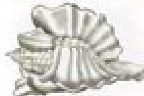
Foliate Thornmouth (W)

Cerithium foliatum To 1.5 in. (4 cm) high Shell has three large, leaf-like flanges. Color varies from white to dark brown depending on location.