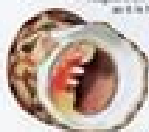
Bleeding Tooth (CB)

Hydrobia ulitiformis To 1 in. (2 cm) Brown to white shell has body and apical ridges. Species found in shallow waters have smoother shells. Feeds on biofilms.