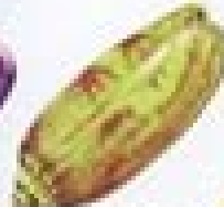
Lettered Olive (CB, CB)

Olivella biplicata To 1.5 in. (4 cm) high Smooth shell has a conical apex. Color varies from purple to white and brown. Carnivorous scavenger feeds on animal remains. Shells were used by Native Americans in jewelry.