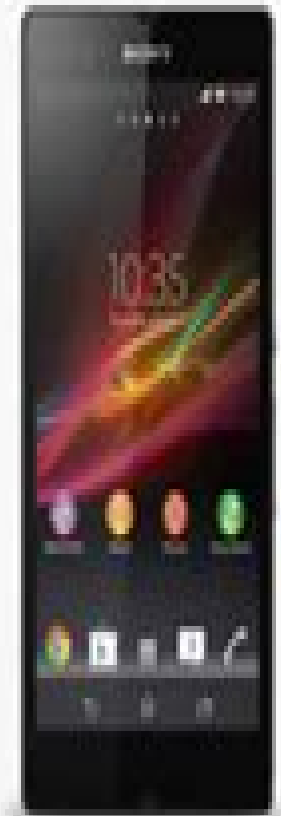
Sony Xperia Z