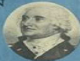
Charles C. Pinckney

A CRITICAL ANALYSIS OF "AN ECONOMIC INTERPRETATION OF THE CONSTITUTION"