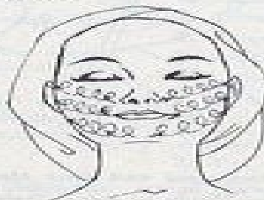
14. Rotary Movement of Cheeks. Massage from chin to ear lobes; mouth to middle of ears, and from nose to top of ears.