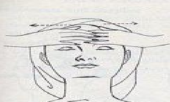
7. Stroking (headache) Movement. Slide fingers to center of forehead, then draw fingers with slight pressure toward temples and rotate.