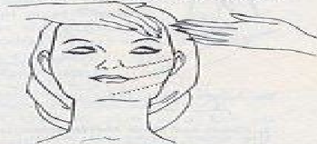
15. Light Tapping Movement. From chin to ear lobes; mouth to ear; nose to top of ear, and then across forehead. Repeat on other side.