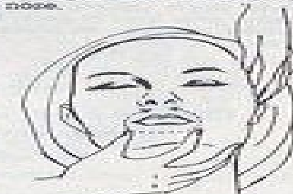
12. (Optional Movement). Hold head with left hand; draw fingers of right hand from under the lower lip, around mouth to center of upper lip.