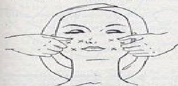
13. Pinching Movements of Cheeks. Proceed from the mouth to ears, and then from nose to top part of ears.