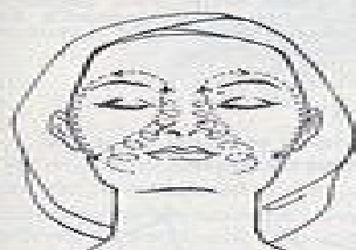
10. Mouth and Nose Movement. Apply circular movement from corner of mouth up sides of nose. Slide over brows and down to corners of mouth.