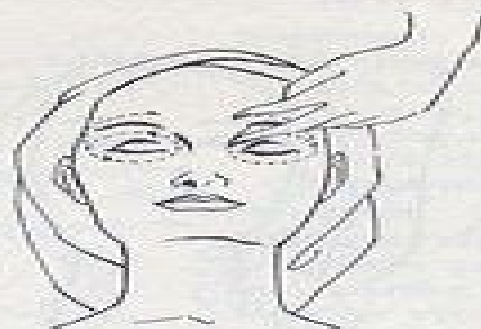
8. Eye Movement. Place middle fingers at inner corner of eyes and index fingers over brows. Slide to outer corners of eyes, under eyes and back.