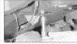
Fig. 26. Heater control panel fan speed selector