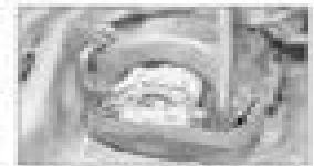
Fig. 26. Heater control panel fan speed selector