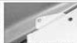
Fig. 26. Heater control panel fan speed selector

2. Remove the fan control valve from the air distribution housing, taking care to remove the electrical wiring, then remove all control cables as indicated below. Blower motor 1. Disconnect the blower motor from the top of the heater distribution and electrical control system, see the wiring diagram. 2. Disconnect the blower motor from the heater distribution and electrical control system, see the wiring diagram. 3. Disconnect the blower motor from the heater distribution and electrical control system, see the wiring diagram. 4. Disconnect the blower motor from the heater distribution and electrical control system, see the wiring diagram. 5. Disconnect the blower motor from the heater distribution and electrical control system, see the wiring diagram.