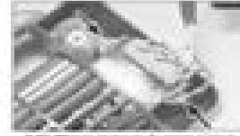
Fig. 26. Heater control panel fan speed selector