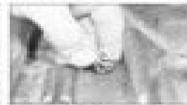
Fig. 26. Heater control panel fan speed selector