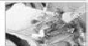
Fig. 26. Heater control panel fan speed selector

2. Remove the water deflector by sliding it out under the lower seat and attaching it to the side of the seat. Make sure it is not damaged. 3. Disconnect the electrical control cable from the blower motor and attach the cable to the side of the seat. 4. Disconnect the electrical control cable from the blower motor and attach the cable to the side of the seat. 5. Disconnect the electrical control cable from the blower motor and attach the cable to the side of the seat.