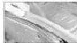
Fig. 26. Heater control panel fan speed selector

3. Remove the water deflector by sliding it out under the lower seat and attaching it to the side of the seat. Make sure it is not damaged. 4. Disconnect the electrical control cable from the blower motor and attach the cable to the side of the seat. 5. Disconnect the electrical control cable from the blower motor and attach the cable to the side of the seat.