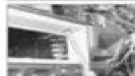
Fig. 26. Heater control panel fan speed selector

2. Remove the fan control valve from the air distribution housing, taking care to remove the electrical wiring, then remove all control cables as indicated below. Blower motor 1. Disconnect the blower motor from the top of the heater distribution and electrical control system, see the wiring diagram. 2. Disconnect the blower motor from the heater distribution and electrical control system, see the wiring diagram. 3. Disconnect the blower motor from the heater distribution and electrical control system, see the wiring diagram. 4. Disconnect the blower motor from the heater distribution and electrical control system, see the wiring diagram. 5. Disconnect the blower motor from the heater distribution and electrical control system, see the wiring diagram.